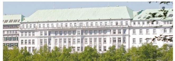
Fairmont Hotel Vier Jahreszeiten (5 min by taxi) Neuer Jungfernstieg 9-14, 20354 Hamburg +49 (0) 040-34940 www.hvj.de