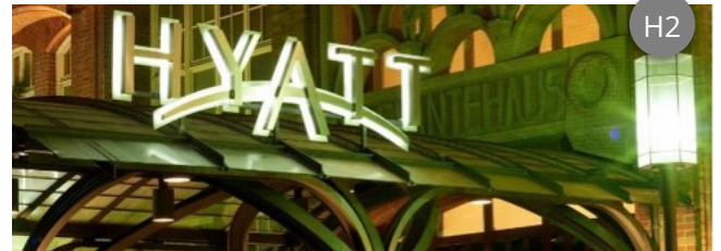
Park Hyatt Hamburg (5 min walk) Bugenhagenstraße 8, 20095 Hamburg +49 (0) 40 - 33321234 hamburg.park.hyatt.com