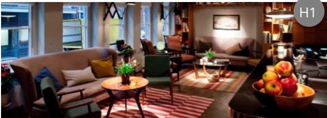
HENRI Hotel (5 min walk) Bugenhagenstraße 21, 20095 Hamburg +49 (0) 40 - 554357557 www.henri-hotel.com